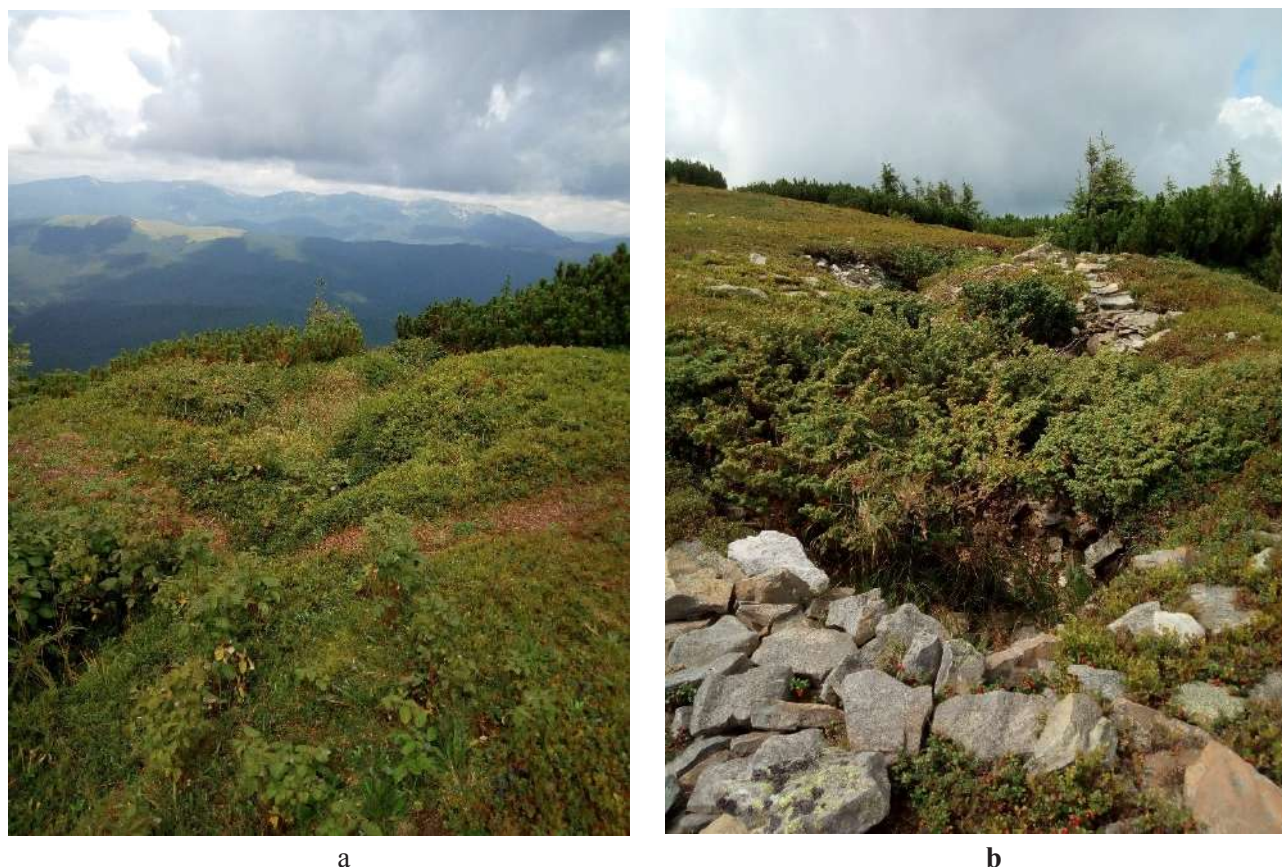
Fig. 5. Fragments of the fortification line on the summit of the Chorna Klyva mountain. a – turf covered line of entrenchments in front of the view of the Dovbushanka ridge (Gorgany range); b – turf covered fire-point trenches

served as a command point. A fragment of the road cut into the slope and strengthened with stone retaining walls is observable between the two locations.