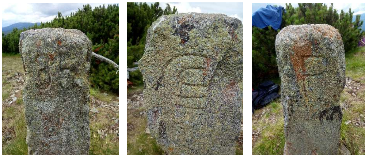
Fig. 1. Borderline pole #35 at the top of the Chorna Klyva mountain

and consisted of smaller strongpoints, covered firing points, and machine-gun pits. It is worth noting that, within the Bratkovskiy ridge, the Szent László fortifications have never been part of an actual battlefield, especially during the East-Carpathian Operation , which was happening in September-October 1944. It is probably due to this fact that they remained intact until the present day (Halahan et al, 2018; Ravasz, 2006; Szabó, 2002).