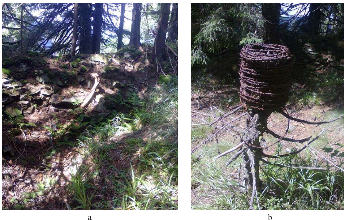
Fig. 6. a – Fragment of an earthen breastwork next to the command strongpoint. b – coil of barbed wire in front of the earthen breastwork.

hikes to the most important tourist attractions in the area. Active involvement of local households into the hospitality business is instrumental for improving employment among the local population.