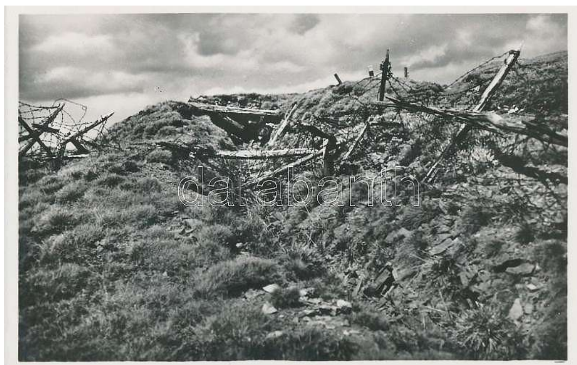
Fig. 3. A post-card depicting fortifications on the Chorna Klyva mountain during the interwar period

Analysis of the literary sources, maps and archived materials allows comparing vegetation covering the area in question. The topographic map issued in 1935 by the Military Institute of Geography (Wojskowy Instytut Geograficzny (WIG)) in Warsaw designates the upper areas of the Bratkivsky ridge (including the Chorna Klyva mountain) as moorlands and pastures (see Fig. 4). According to Stoyko (2012), it was