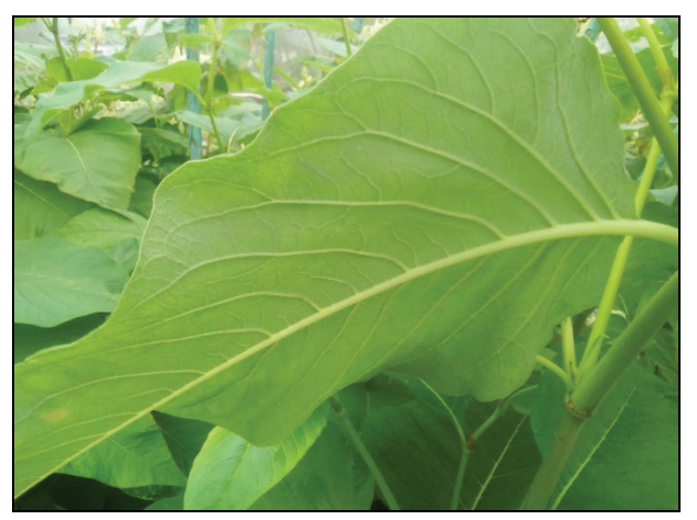
Fig. 8. Bottom side of leaves of P. weyrichii

tively high, ranging 40–50 to 150–200 or more (Zhurina & Kostko, 1992). Seeds ripen almost everywhere.