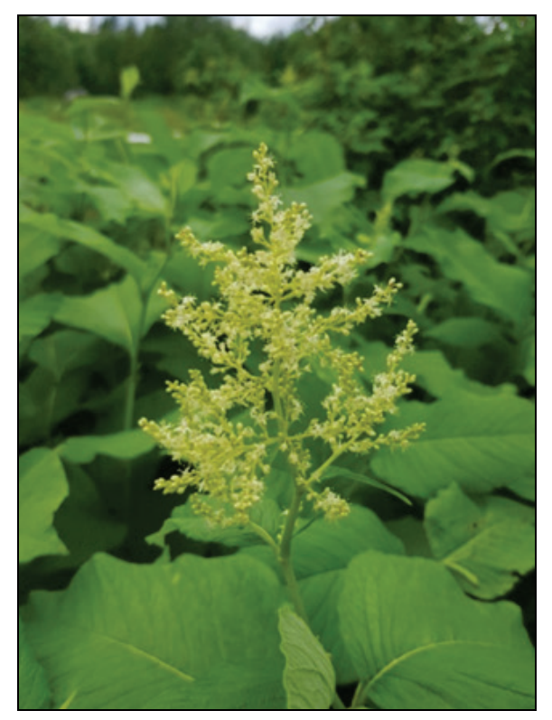
Fig. 1. P. weyrichii plants

Among the plants growing in the Murmansk region, the most promising as a possible source of flavonoids is Weyrich's knotweed ( Poligonum weyrichii Fr. Schmidt) introduced to the Kola Peninsula in the 1920s (Fig. 1).