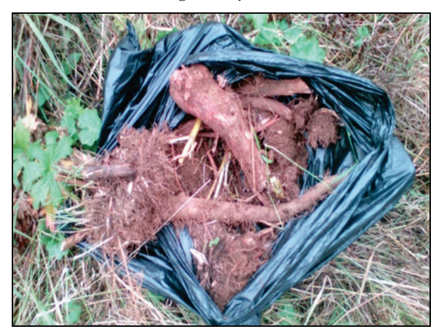
Fig. 3. Underground organs of P. weyrichii

The stems of plants are straight, slightly curved at the nodes, deeply furrowed, hollow, pubescent at internodes (weakly below, strongly above), slightly branched. The diameter of the shoots in the lower part is up to 2 cm. At the young age, the stems are green; by the seed ripening phase they turn brown (Fig. 4, 5). Shoots slightly lignify only at the very lower part. The height of the shoots in the first year is up to 1 m, in the second up to 1.5 m, in the third and subsequent years – up to 3.0 m and more (Zhurina & Kostko, 1992). The number of stems on a plant also depends on age, in the first year – 1, in the third – 3–4, in the third – 4–5, in subsequent years – up to 10. In the nodes of the stalk there are ochreas up to 5 cm in size. They serve as a means of protecting inflorescences and growth points against adverse conditions. Leaves are positioned on the ochreas (Fig. 6). The leaves are oval or broadly ovate, slightly cordate, sharp-tipped, with a petiole up to 10 cm and a leaf