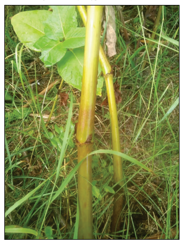
Fig. 5. Stems in the seed ripening phase of P. weyrichii

Weyrich's knotweed forms a large number of leaves on one plant. The leafiness of Weyrich's knotweed, depending on the development phase and planting density, changes, with high density, the lower leaves fall off. The inflorescences of Weyrich's knotweed are a loose panicles, terminal and axillary panicles, terminating the main and lateral shoots.