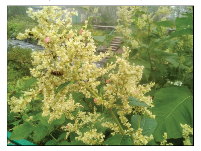
Fig. 9. Inflorescences of P. weyrichii

Chemicals. Ethanol 96% was supplied by Dia_M (Moscow, Russia). Methanol (gradient grade for liquid chromatography), sodium carbonate (>99%), gallic acid anhydride (>99%), sodium nitrite, and aluminum chloride hexahydrate was supplied by Merck (Sofia, Bulgaria). Folin–Ciocalteau reagent, rutin hydrate, quercetin hydrate (≥95%), tannic acid (≥91%), pyrogallic acid (≥98%), (+)-catechin hydrate (≥96%), sodium hydroxide, and Trolox (6-hydroxy-2,5,7,8-tetramethylchroman-2-carboxylic acid) (97%) were supplied by Sigma Aldrich (St Loius, USA). Ammonia iron alum was supplied by Biochemmak (Moscow, Russia). Deionized water was from a MilliQ water deionizer supplied by Millipore (USA).