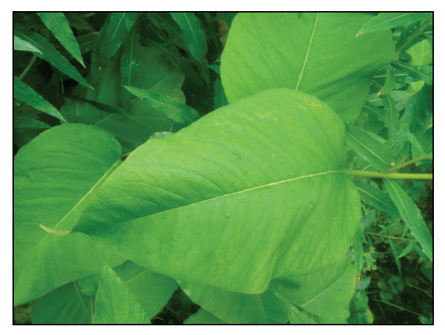
Fig. 7. Top side of leaves of P. weyrichii

The fruits are small, they are located in the sepals of three outer perianth lobes. The fruit is a brownish trihedral nut with a mat uneven surface, its length is about 1 mm. Weight of 1,000 fruits (seed) ca 2.5–4.0 g. The Weyrich's knotweed reproduction rate, due to the low seeding rate and fairly good seed productivity (even at low fertility), is rela-556