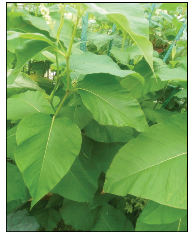
Fig. 4. Stems of young plants of P. weyrichii

blade reaching 30 cm in length and 15 cm in width. They are bare above, and covered with thick felt pubescence below (Fig. 7, 8).