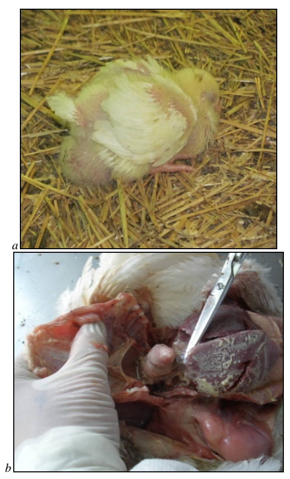
Fig. 1. Clinically sick chicken Hubbard cross ( a ) and pathological changes in chicken with coli bacillosis ( b )

The evaluation of isolated E. coli 88 showed the resistance to Doxycycline (diameter of the growth inhibition zone 2.5 \pm 0.27 mm), Josamycin ( 4.3 \pm 0.47 mm), and Azithromycin ( 5.1 \pm 0.56 mm). The resistance of S. aureus k99 was also detected to Azithromycin, Josamycin, Ceftriaxone and Ciprofloxacin. In the subsequent study we expanded the antibiotics spectrum of different groups and tested the potential antimicrobial action of new derivatives of 1,2, 4-triazole.