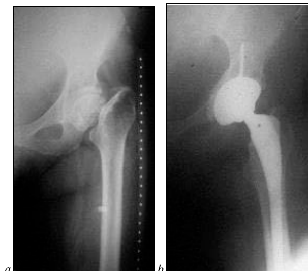
Fig. 2. Radiograph of a patient with pseudoarthrosis of the femoral neck following conservative management: a – preoperative, b – postoperative radiograph after THA

was determined using ready-made sets of reagents. Contents of interleukins (IL-1, IL-4, IL-6) and C-reactive protein in patients' blood serum was determined by solid-phase "sandwich" method – a variation of immunoenzyme analysis. Measurements were made at a wavelength \lambda = 450 nm for all cytokines. Statistical analysis was performed using Statistica 10.0 software (Statsoft Inc., USA); by parametric Student criterion and non-parametric Wilcoxon criterion.