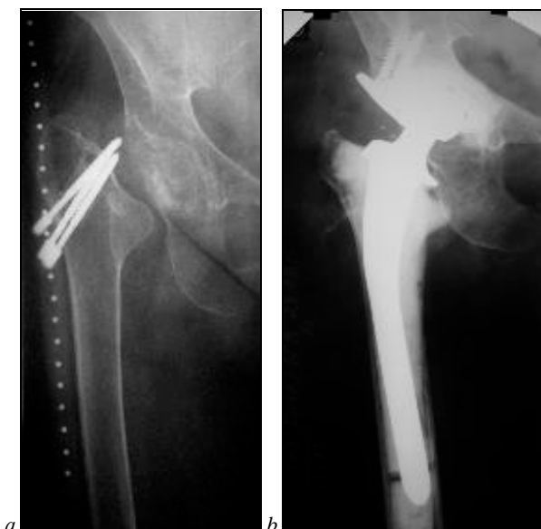
Fig. 1. Radiograph of a patient with pseudoarthrosis of the femoral neck following failed internal fixation: a – preoperative, b – postoperative radiograph after THA

The following markers were detected in the blood serum of patients: total protein by biuret test, albumin by reaction with bromocresol green, glycoproteins by the modified A. P. Stenberg and Y. N. Dotsenko method, sialic acids by the Hess method, chondroitin sulfate by the Nemeth-Csoka method modified by L. I. Slutsky, haptoglobin by reaction with rivanol, glucose by the enzymatic colorimetric method, triglyceride content was measured colorimetrically. The activity of the enzymes alanine aminotransferase (ALT), aspartate aminotransferase (AST), alkaline phosphatase and gamma-glutamyl transpeptidase (GGT) was determined by kinetic methods. The activity of acid phosphatase by the Bodansky method, the thymol test was performed following the method of Popper and Huergo. The content of fibrinogen in the blood plasma of patients